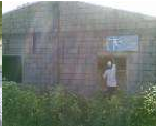
The Carpenter is Busy