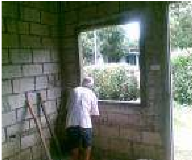
Inside the Front Window