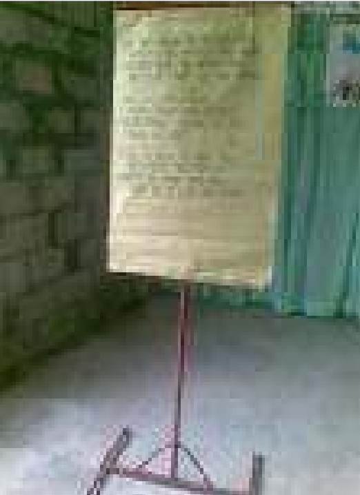
The Song Stand