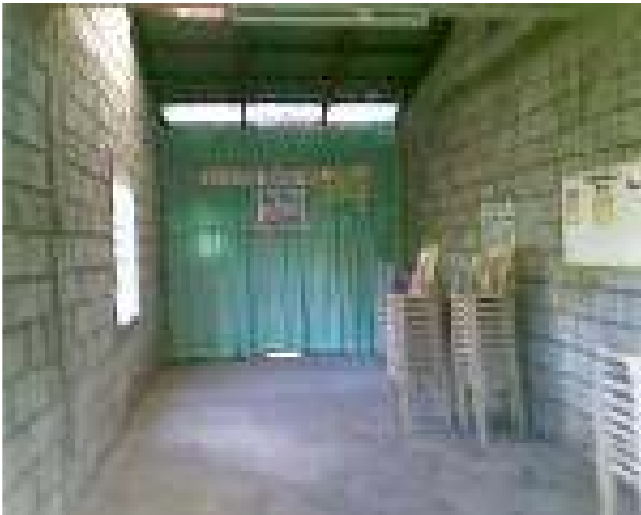
Inside of the Worship Center