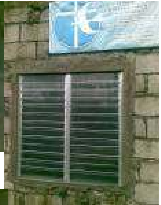
The Front Window