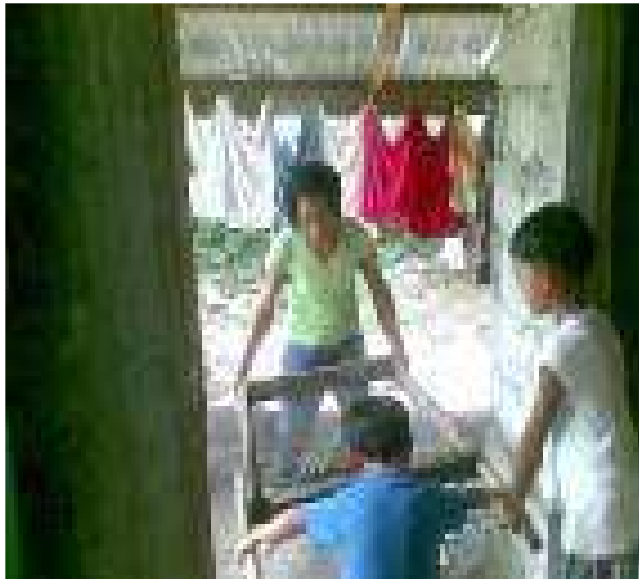
Even the wife and the Kids were involved