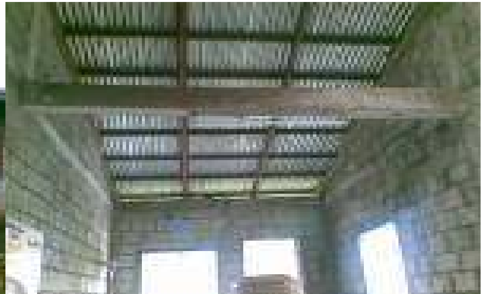
here the ceiling fan to be installed here thru your love gift