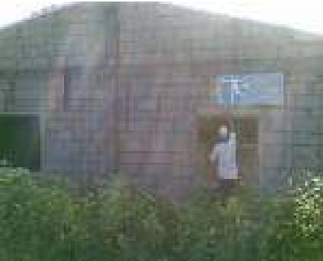
The Carpenter is Busy