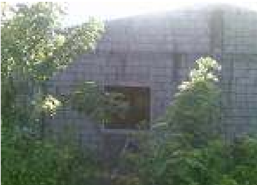
The Side Window