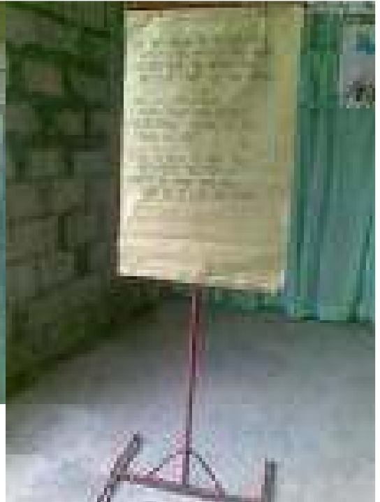
The Song Stand