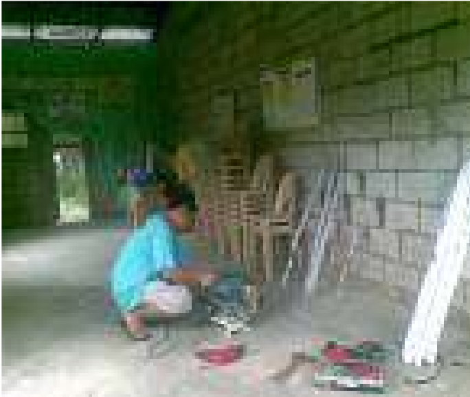
The one who mounted jalousies