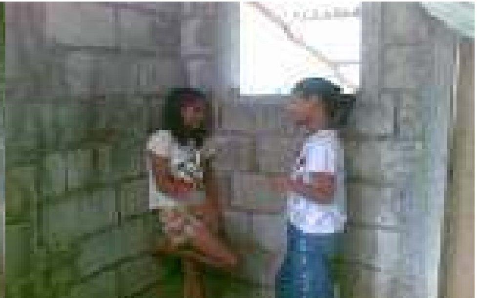
inside of the back window with our 2 youth