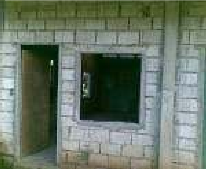
The Front Door