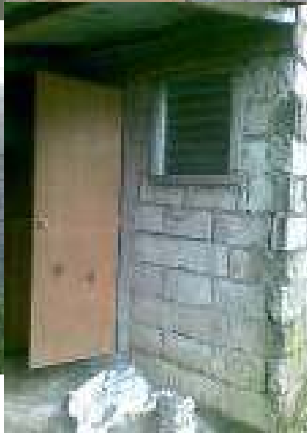
The Window at the back