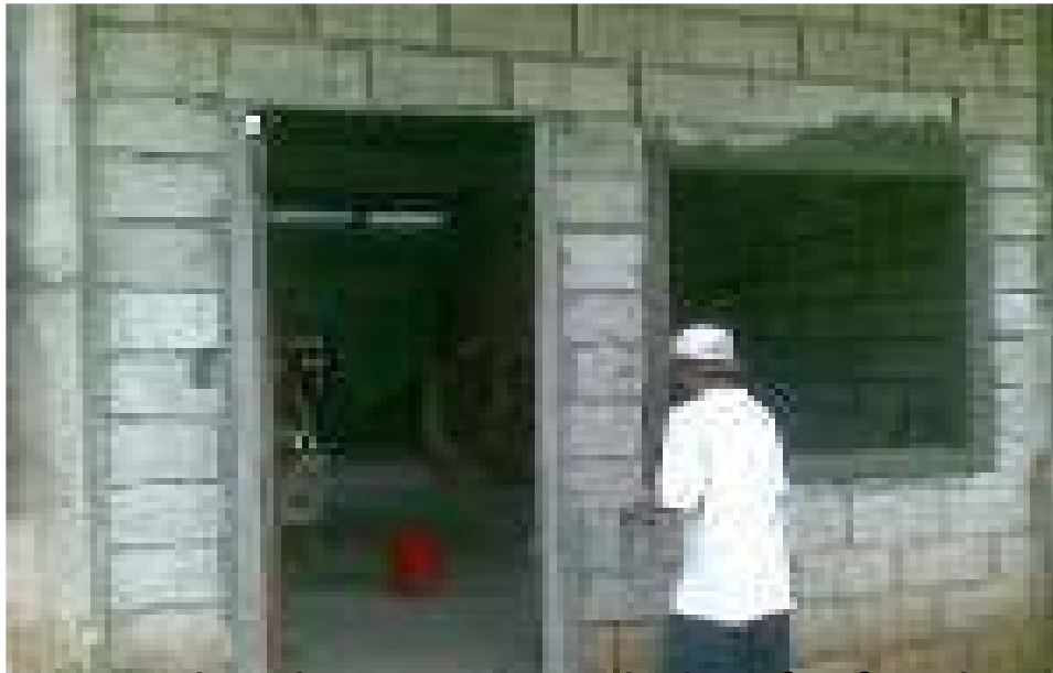
preparing the concrete window for framing at the front