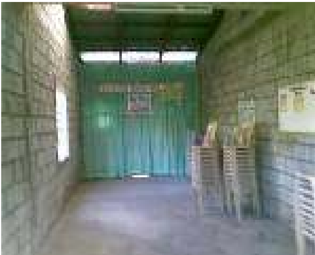
Inside of the Worship Center