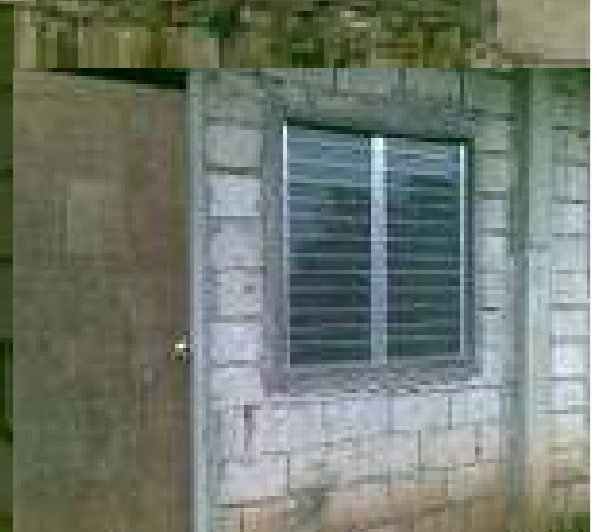
Front door and window with jalousies mounted in it