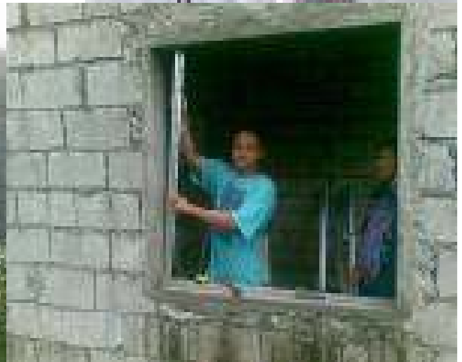
Preparing the Aluminum and Steel Frame