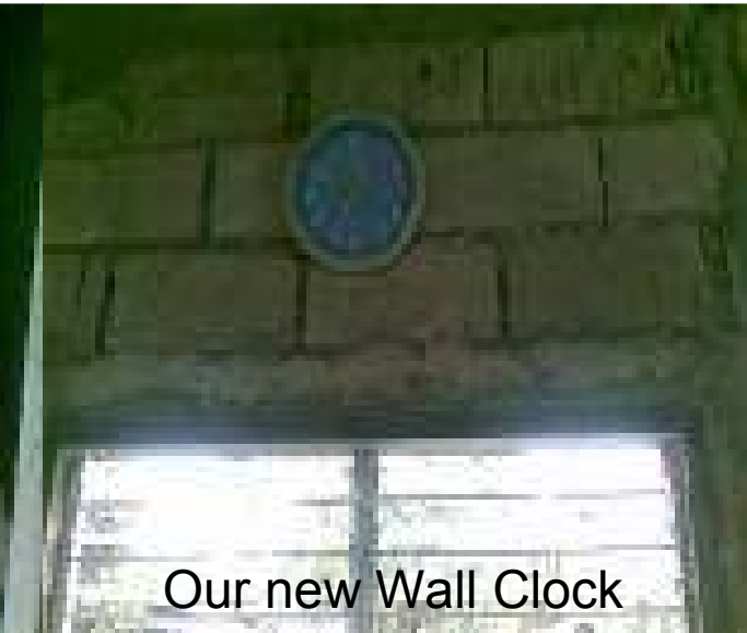
Our new Wall Clock