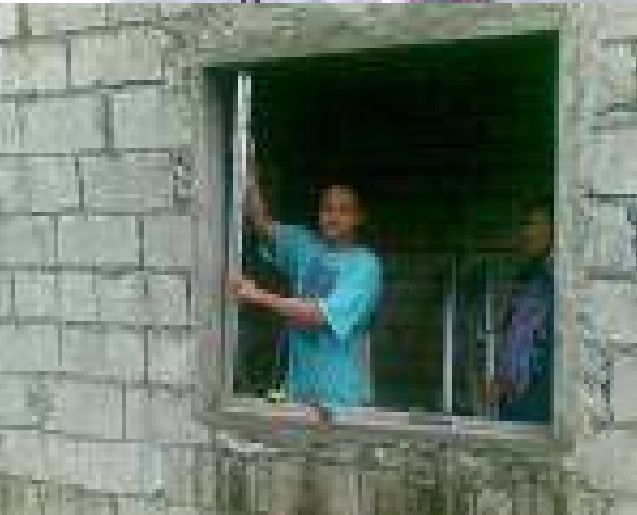
Preparing the Aluminum and Steel Frame