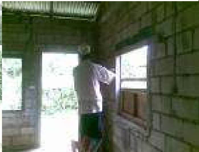
Preparing concrete for window frames