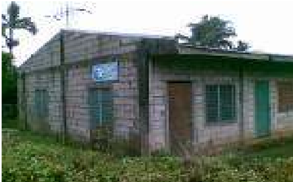
the completed task... TO GOD BE THE GLORY